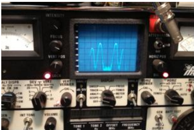
IFR Spectrum Analyzer showing the second Bessel carrier null

At that point, Bessel Function math says that the carrier is being modulated to exactly 100% of allowed deviation which for US FM broadcast is of course +/- 75 kHz.