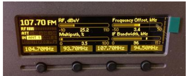
This 107.7 Stereo signal was monitored from 20 miles away. Note the low multipath.

The automatic input RF attenuator in the DEVA made testing using the external antenna a snap.