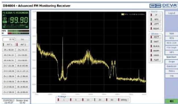
The DB4004 FFT WEB interface spectrum analyzer display

The Fast Fourier Transform (FFT) internal spectrum analyzer mode is especially impressive when viewed using the built-in web interface.