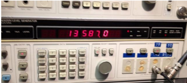
A precision audio oscillator with GPS reference was used for the Bessel Function test

There is a relatively simple and highly accurate way to check the accuracy of FM modulation monitors without sending them to the factory. As many of you know, the test is done by modulating an FM transmitter with a very precise audio sine wave of 13587.0 Hz. and observing the transmitter's RF output on a spectrum analyzer.