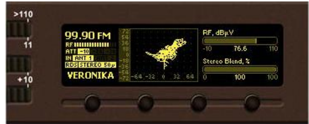
DB4004 X-Y Stereo Display

The DB4004 has very fast built-in front panel and web interface oscilloscope displays. Not only can you view all FM demodulated waveforms, but the monitor even has an X-Y mode that shows stereo phasing.