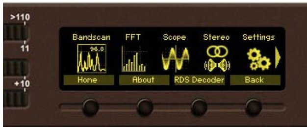
DEVA DB4004 Menu Screen

You have an incredible amount of control over instrument parameters. For instance, you can set the IF bandwidth in 15 increments from 15 kHz to 157 kHz – or let the device do bandwidth selection automatically.